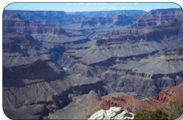
Above: The Grand Canyon

To carry out my experiment on a smaller, more manageable scale, I decided to focus on just one section of the rock layers — the fossil layers associated with dinosaurs, the Triassic, Jurassic, and Cretaceous rock layers. At the time, I did not know of a single modern plant or animal living during the dinosaur era, except for a few well-recognized so-called "living fossils." Living fossils are fossils which look very similar to modern plants or animals. 4 But even these dinosaur-era "living fossils" — the dragonfly, the garfish, the coelocanth fish, and the horseshoe crab — were so different from the living forms they were assigned different