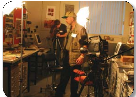
Above: Setting up for an interview at the South Australian Museum in Adelaide.